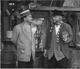
Bob Hope (right)