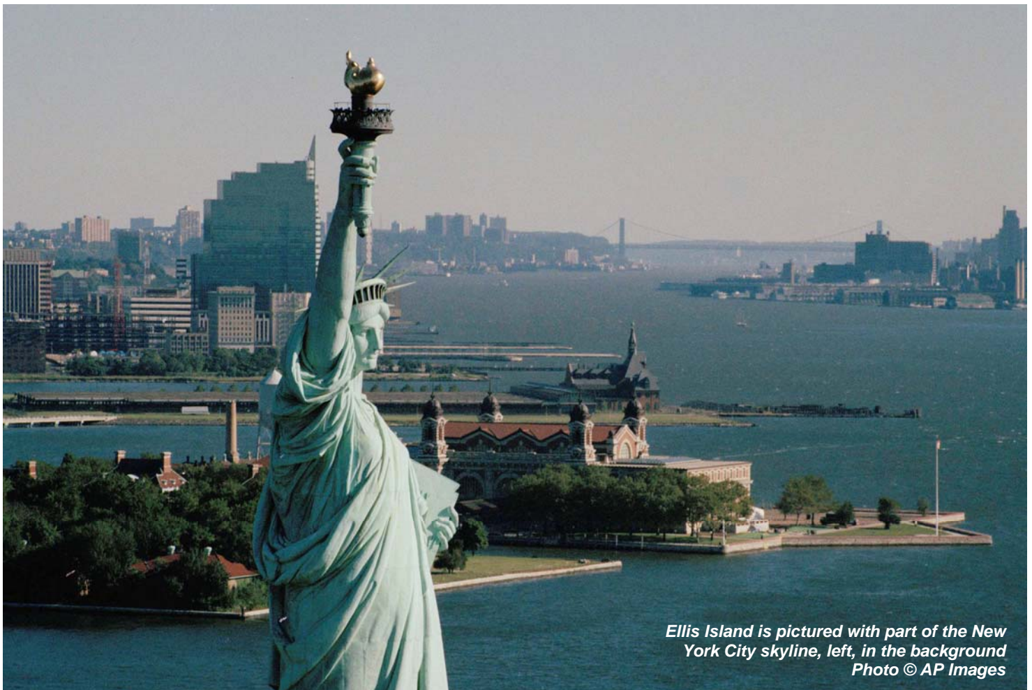
Ellis Island is pictured with part of the New York City skyline, left, in the background

Even though there were immigration centers in other major cities such as Philadelphia, Boston, San Francisco, Miami and New Orleans, Ellis Island held a unique place. However, after its closure in 1954 it was neglected until the 1980s. Fortunately, this important chapter in American history was not lost thanks to a major renovation project, the largest in U.S. history, costing $160 million, which turned the old Registry Hall into the Ellis Island Immigration Museum. Each year 2 million tourists come to see the island on which the future of 12 million people was once decided.