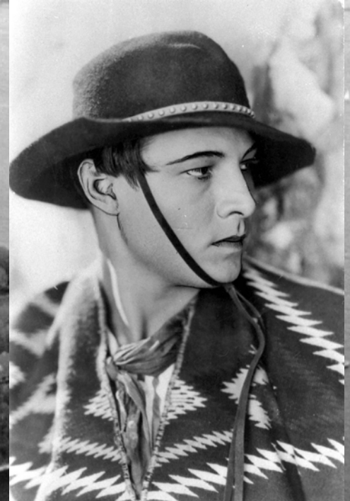
Rudolph Valentino

Fame awaited many immigrants behind the doors of Ellis Island. Careers as musicians, politicians, singers, composers, sportsmen, etc. awaited talented immigrants in their new country. The world of movies would not be what it is without Rudolph Valentino, Bob Hope, or Cary Grant, all of whom immigrated to the United States.