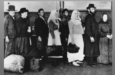
Immigrants, Photo © AP Images

Work on Ellis Island continued from 9:00 in the morning to 7:00 in the evening seven days a week. Inspectors questioned 400 to 500 immigrants in any single day. But the immigration process did not begin on Ellis Island. It started in ports of embarkation where the so-called ship's manifest logs were filled in for the immigrants. They included immigrants' answers to twenty-nine questions such as name, occupation, and the amount of money they had.