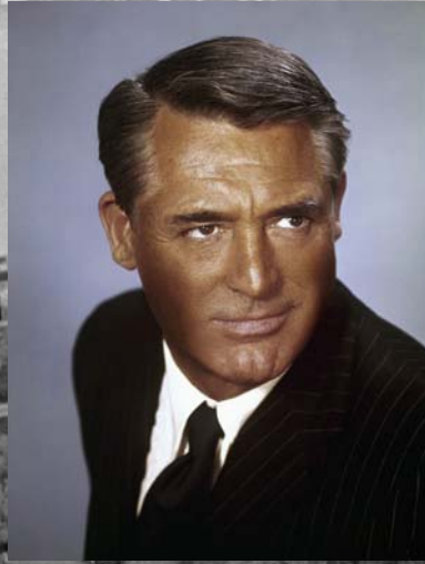
Cary Grant