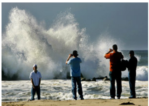
TIOLO AF III age