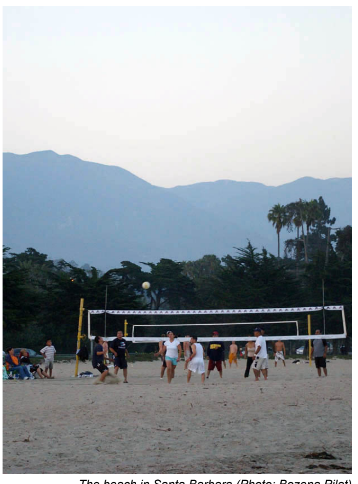
The beach in Santa Barbara