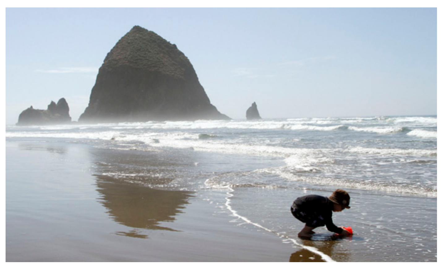
Haystack Rock in Cannon Beach, Oregon

To entice more tourists to visit Clatsop County, the local community organizes events such as the Annual Sand Castle Contest, summer music concerts, which are held in the downtown City Park, book sales, and Independence Day parades.