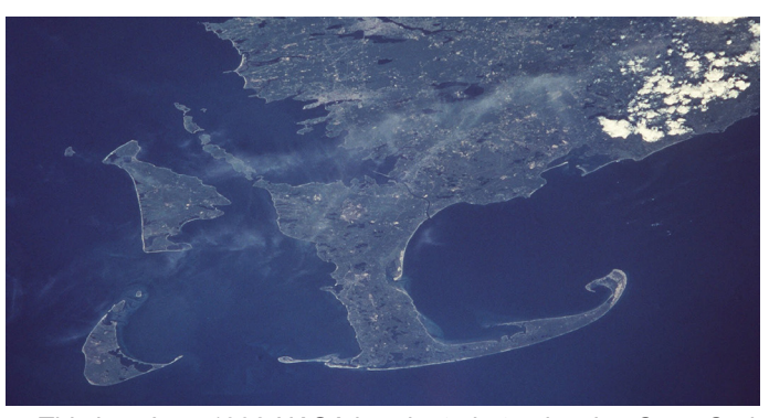
This is a June 1998 NASA handout photo showing Cape Cod, the island of Martha's Vineyard, left, and the island of Nantucket, left-bottom, in a view from space. U.S. Census figures for Massachusetts released Wednesday, March 21, 2001, showed that growth on Cape Cod and the two islands outpaced areas in the rest of the state, and Nantucket was the fastest growing county.