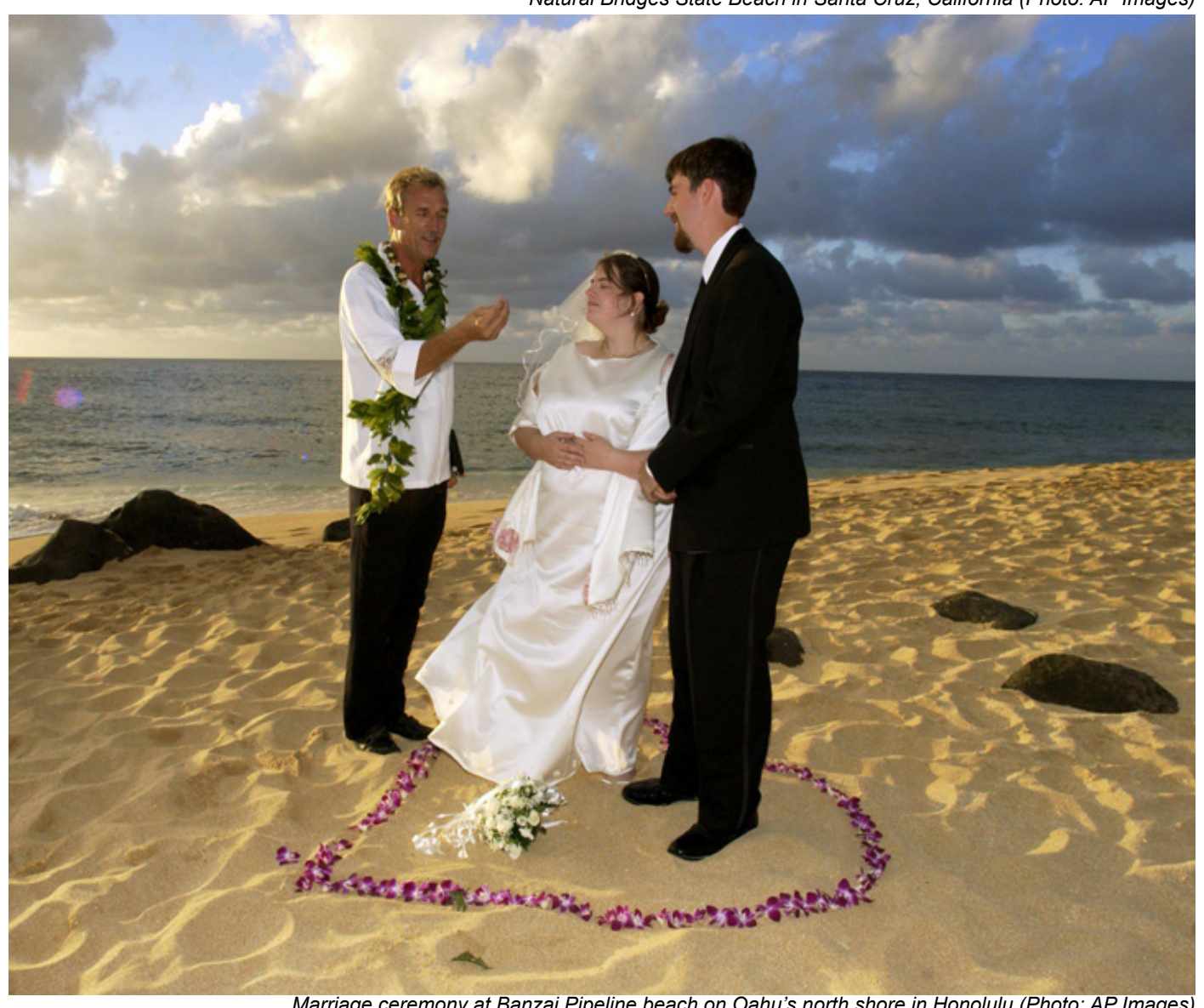
Marriage ceremony at Banzai Pipeline beach on Oahu's north shore in Honolulu