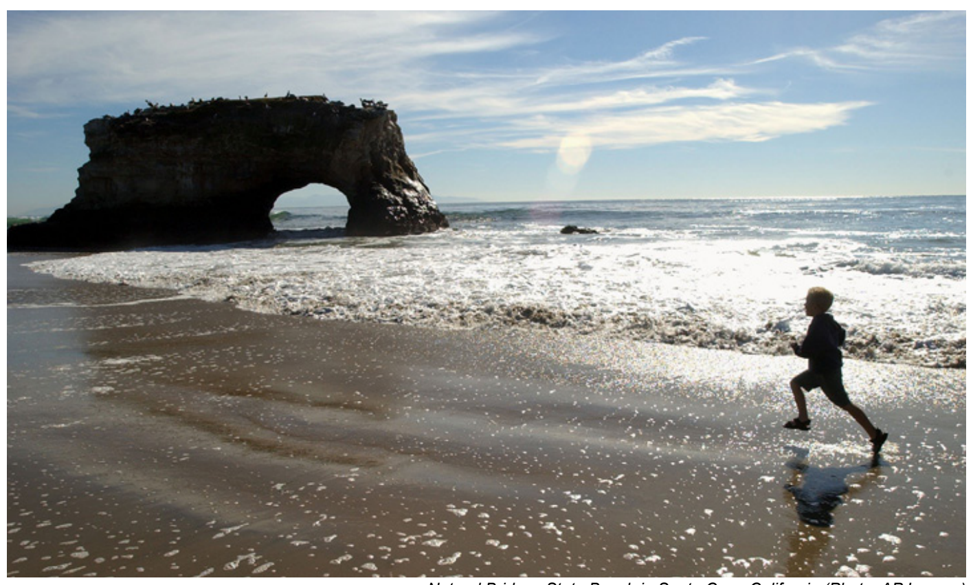
Natural Bridges State Beach in Santa Cruz, California