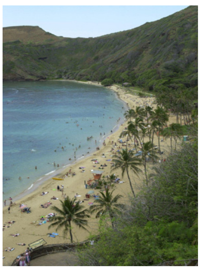
The beach at Hanauma Bay, Hawaii