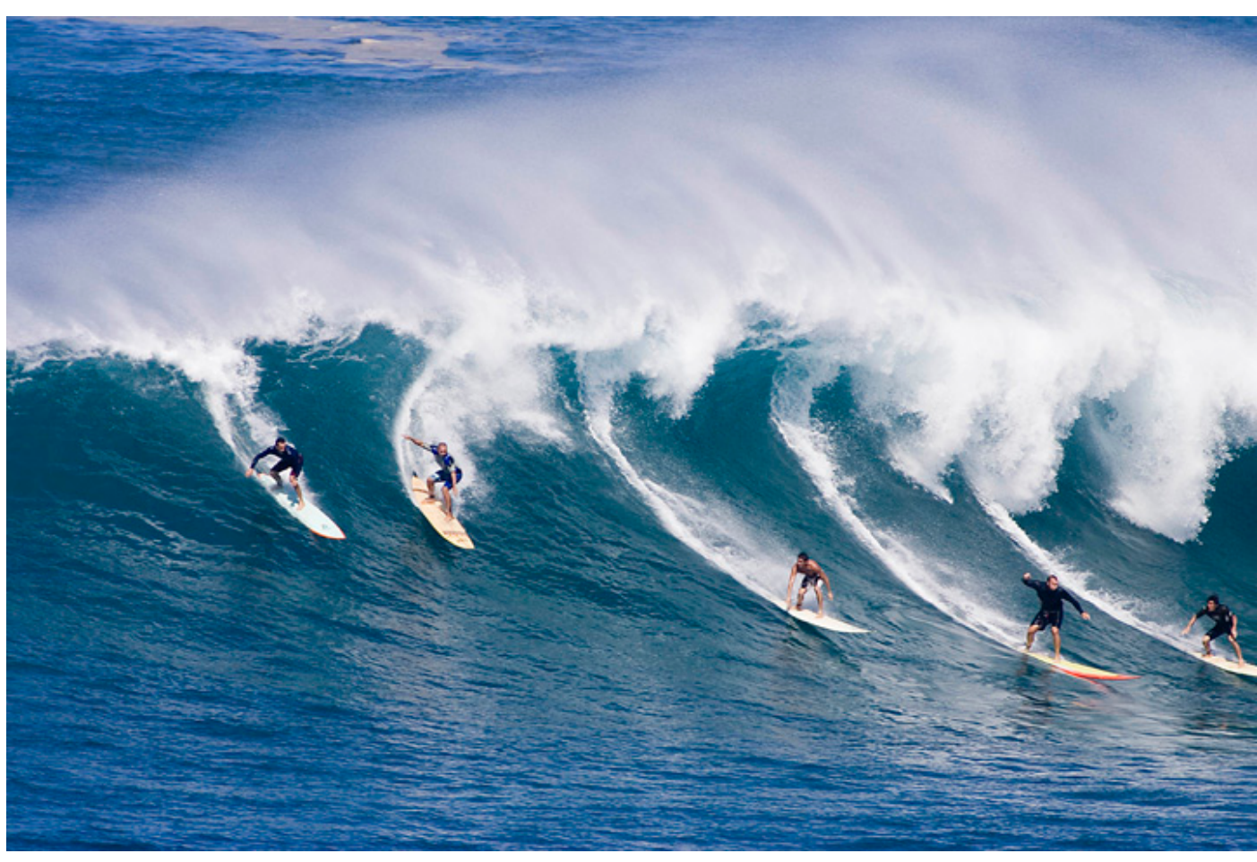
Surfers ride a wave at Waimea Beach on the North Shore of Oahu, Hawaii