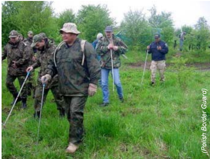
(Polish Border Guard)

In May 2004 the Polish Border Guard in the region of Warmia and Mazury was trained by U.S. Customs and Border Protection officials, who protect the U.S.-Mexican border.