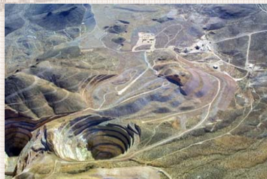
The Castle Mountain open-pit mine near Ivanpah, Calif. Traces left by mining on the environment