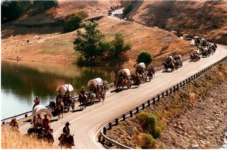
Reenacting history - riders and wagons of the Sesquicentennial Wagon Train pass Lake Camanche, traveling west on Camanche North Parkway, Saturday, June 26, 1999