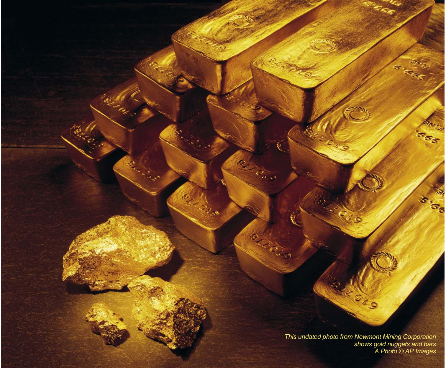
This undated photo from Newmont Mining Corporation shows gold nuggets and bars A Photo © AP Images

The May issue of Zoom in on America tells you about two great 19th century gold rushes, one in California and the other in Alaska. As you can see below, this time exercises come early - the first is already on this page. And there are more on p.4, as usual. Please have a look at the glossary, where the "gold" vocabulary is provided.