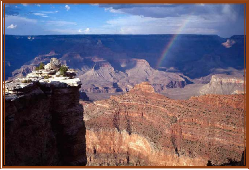
Rainbow in the Grand Canyon as seen from near Mather Point on the South Rim, Grand Canyon N.P.

The Grand Canyon is the world's largest gorge. It measures 466km in length, 29km in width and 1.6km in depth.