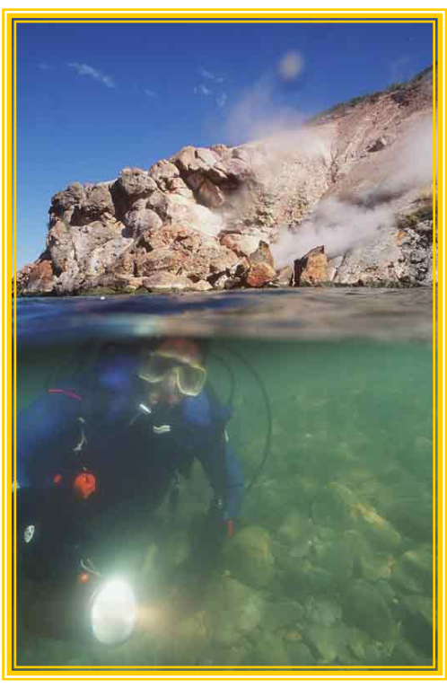
Yellowstone National Park Ranger Gary Nelson explores thermal vents at Mary Bay at Yellowstone Lake

To learn more about national parks in the USA visit: http:// www.nps.gov/ or become a webranger: http://www.nps.gov/