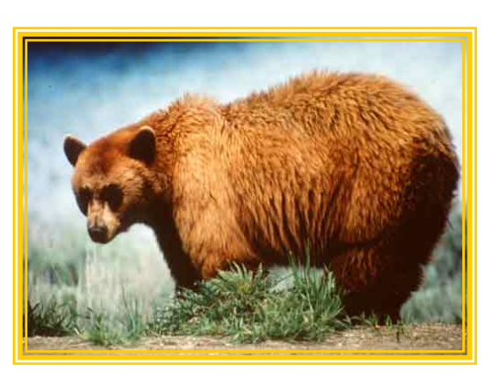
A Grizzly bear inside Yellowstone National Park, photo provided by the National Park Service. Photo ©AP/WWP

More than twice the size of Grand Canyon (almost 900,000 ha), Yellowstone spreads out over the territory of three states: Wyoming, Idaho and Montana. It was the first national park established in the USA in 1872. This unique area is studded with thousands of geothermal wonders such as steaming geysers, cauldrons of bubbling mud, hot springs, fumaroles and smaller vents. It all began about 600,000 years ago with a great volcanic eruption, which ravaged the plateau. Today, an active underground volcano still melts the rock and thus produces magma which heats surface waters forcing them up