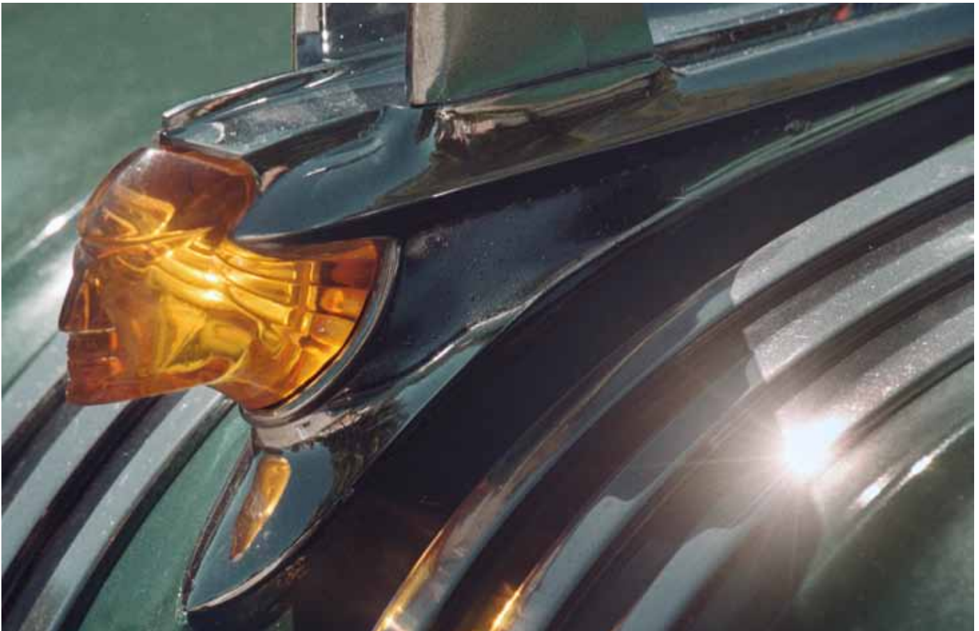
The hood ornament of a 1953 Pontiac Chieftain.

At a time when Tecumseh was away from Prophetstown, William Henry Harrison attacked and burned down the village. During the war of 1812, Tecumseh sided with the British against the United States and aided the British in capturing Detroit. On October 3, 1813, Tecumseh died during the Battle of the Thames; his dream of a pan-Indian confederacy died along with him.