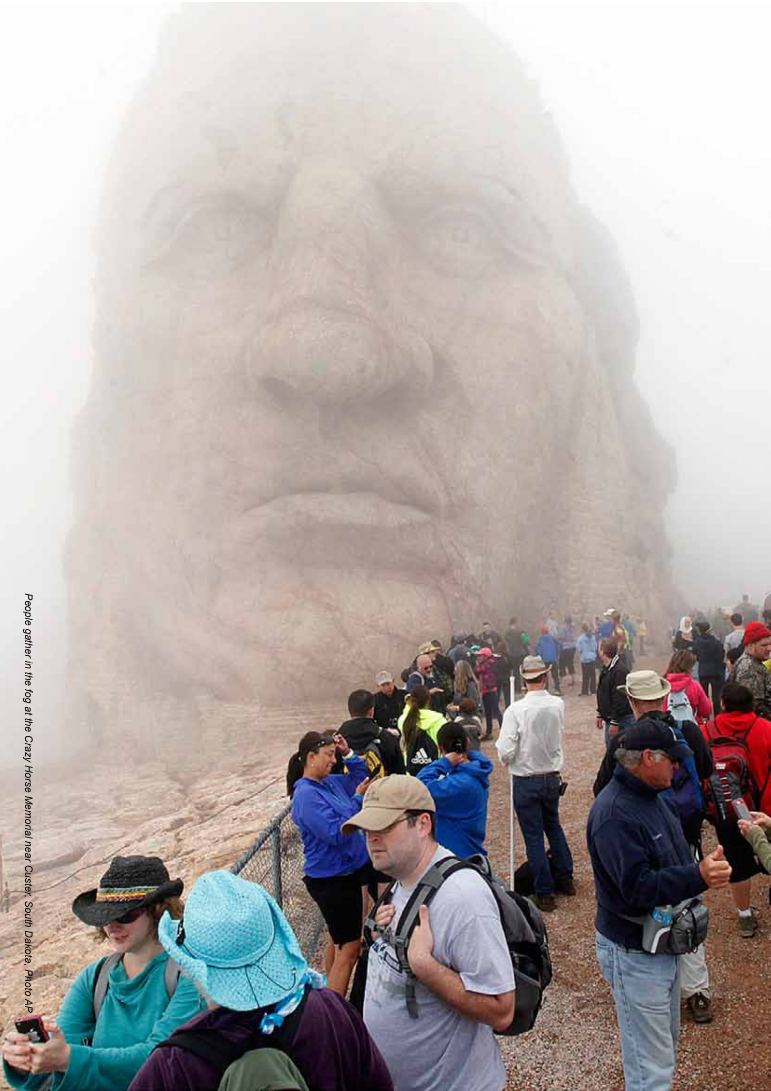
People gather in the fog at the Crazy Horse Memorial near Custer, South Dakota.