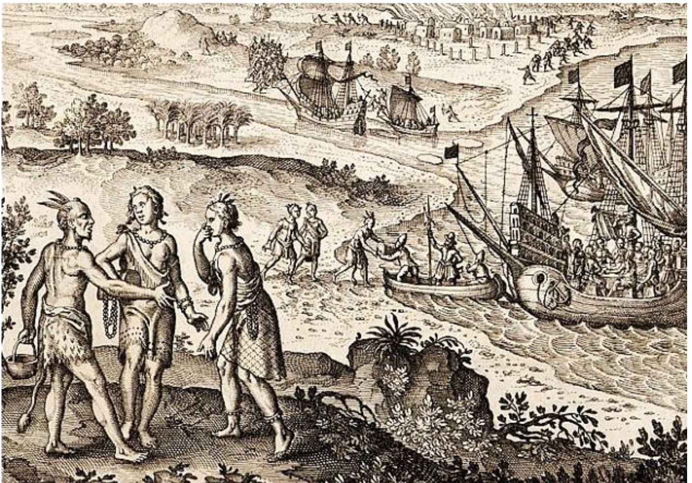
The Abduction of Pocahontas, copper engraving by Johann Theodore de Bry, 1618. page 2

Most records indicate that she was treated with respect and courtesy there. She was taught English and, having been converted to Christianity, she was baptized Rebecca. In the spring of the following year, Pocahontas accepted a marriage proposal from John Rolfe, who grew tobacco in Virginia. Chief Powhatan agreed to the marriage, which took place in April 1614. The marriage brought peace between the English settlers and the Indians as long as Powhatan lived. In the spring of 1616, Pocahontas, her husband, and their one year-old son, Thomas, sailed with a group of other Native Americans to England. Pocahontas was received with honors and entertained at the English court and, even if involuntarily, she promoted the idea of English settlement in America. Pocahontas fell ill while preparing to return to America. She died before leaving England in 1617 at around 21 years of age.