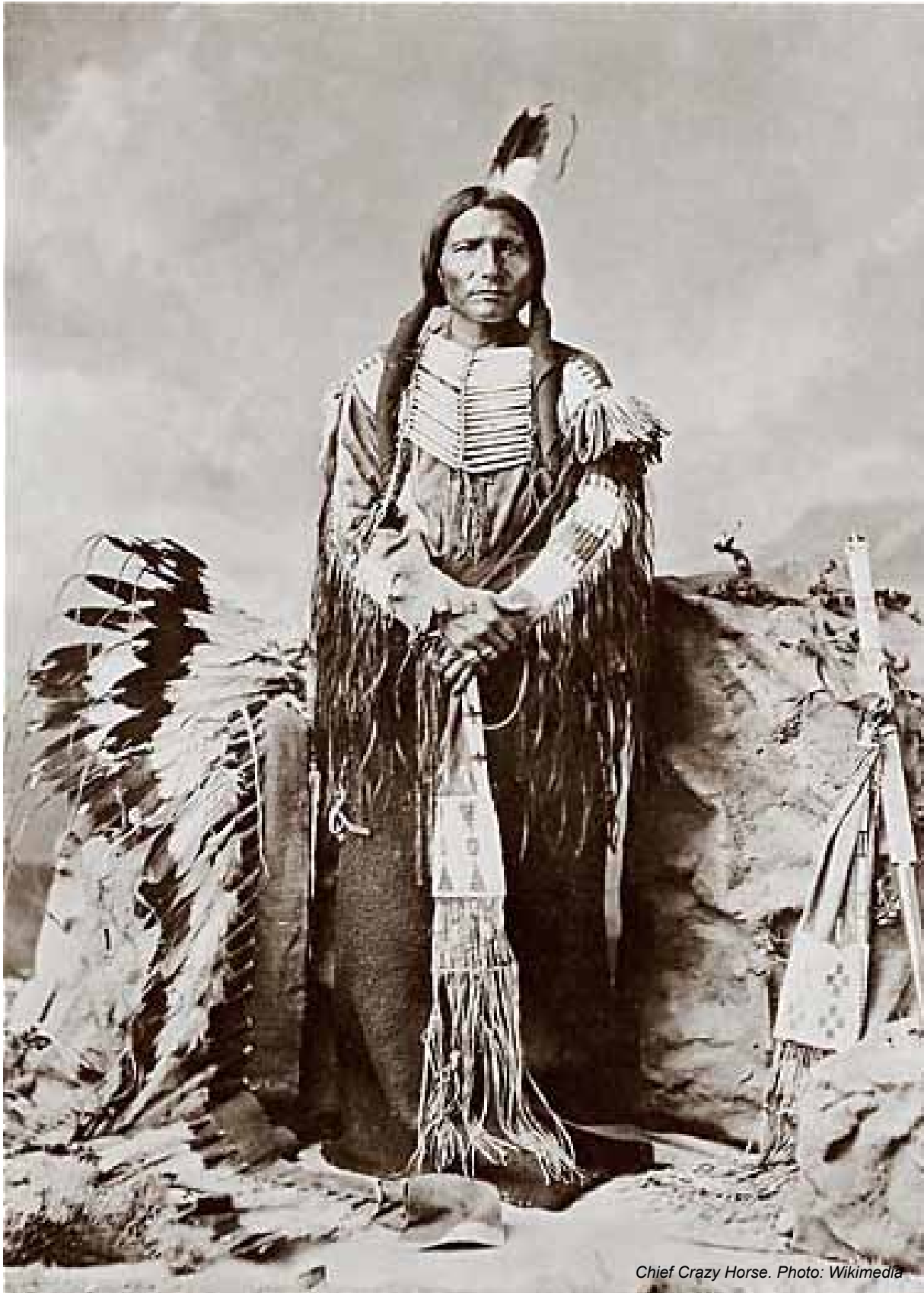
Chief Crazy Horse.