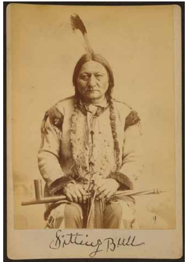
(left): Tecumseh (right): Sitting Bull.