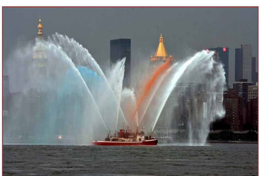
A New York Fire Department boat sprays red, white and blue water in the East River in advance of the 32nd annual Macy's Fourth of July fireworks display, Friday, July 4, 2008 in New York.

What does an average family do on the 4th of July? They organize <u>BBQs</u> and picnics, visit fairs, watch parades, fireworks and marching bands. But many people do travel and go on tours of national parks. If you are planning a visit to the U.S. around July 4, it is advisable to make your bookings in advance.