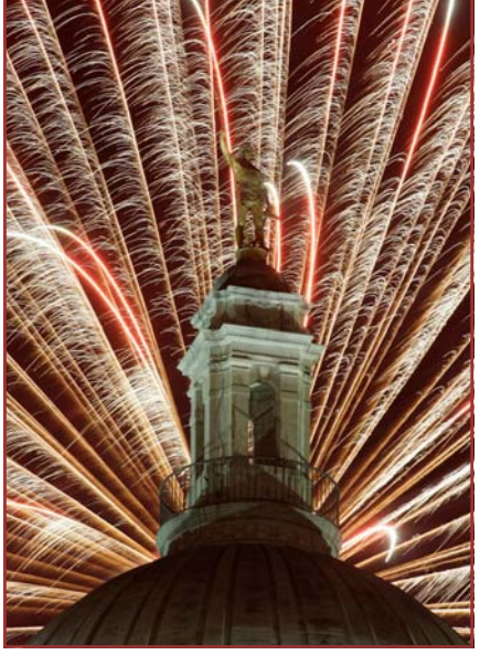
Fireworks burst over the Independent Man, the 11-foot gold covered, bronze statue atop the Rhode Island Statehouse, during Independence Day celebrations.