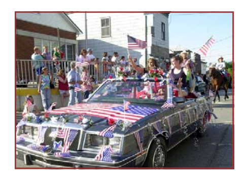
Parade participants during the Independence Day Parade in Mount Olivet, Kentucky.