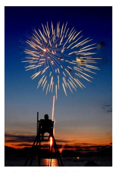
A natural display of color lights up the sky to the north of Whitefish Lake as Fireworks explode over Hunter Brown seated above the crowd in a lifeguard chair during the annual Fourth of July fireworks display at Whitefish City Beach in Whitefish, Montana.

(from The New Oxford American Dictionary)