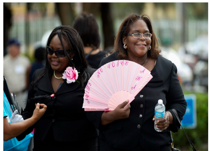
Members of the AKA society prepare to vote early, Sunday, Oct. 28, 2012 in Miami. They were carrying fans that read “No Vote, No Voice”.