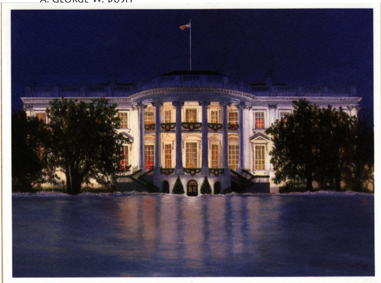
The 1997 White House Holiday Card is a reproduction of Kay Jackson's "White House Nocturne, South Lawn 1997." It features a view of the South Lawn on a winter's evening.

HTTP://WWW.FACEBOOK.COM/PAGES/KRAKOW-POLAND/ZOOM-IN-ON-AMERICA/55275357401