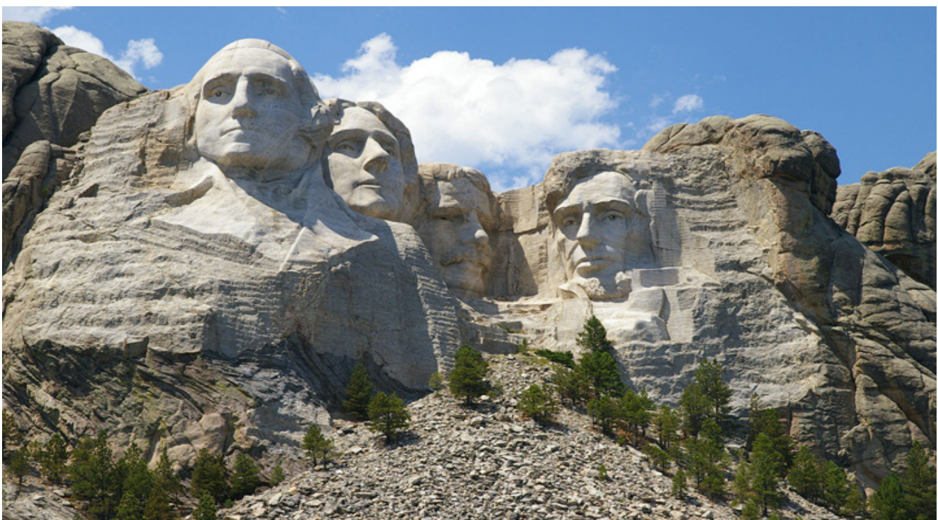
Mount Rushmore National Memorial