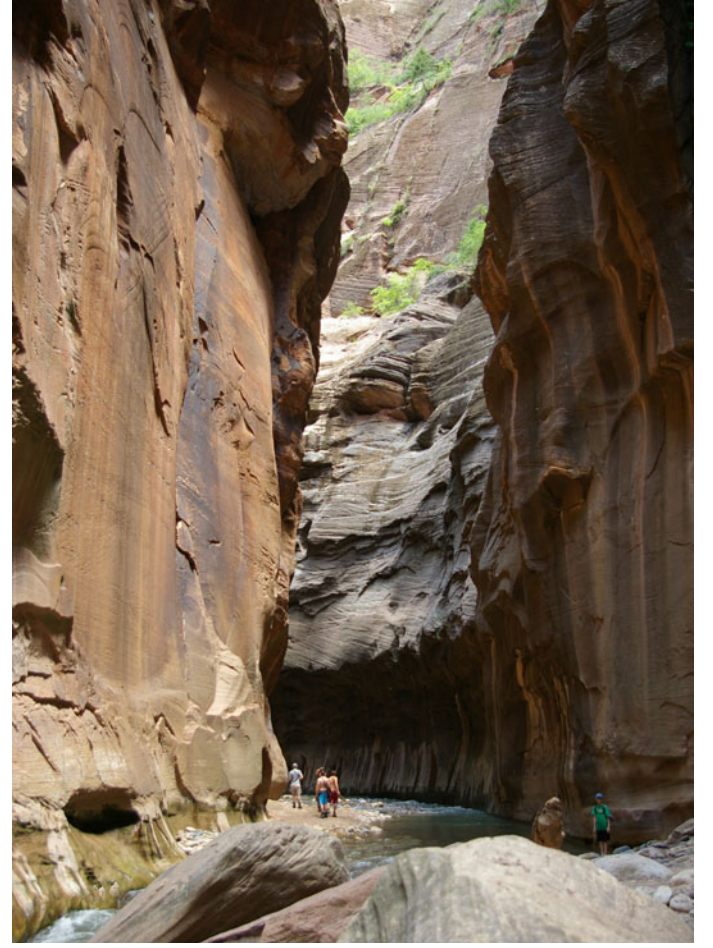
Zoom page 2