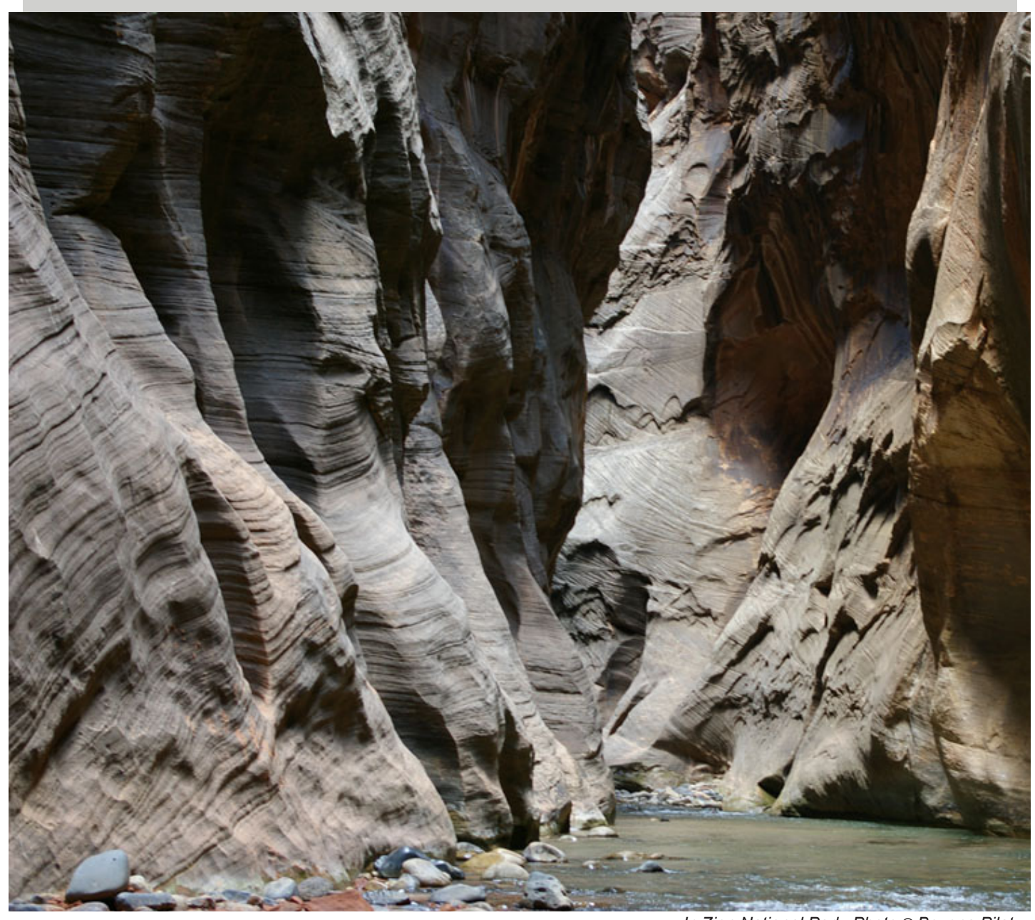
In Zion National Park

'he State of Utah is blessed with outstanding natural features. In a territory of 220,000 km<sup>2</sup> (13th biggest state in the U.S.) there are 13 National, and 42 state parks. Among these Zion National Park is probably the most famous and one of the most beau-