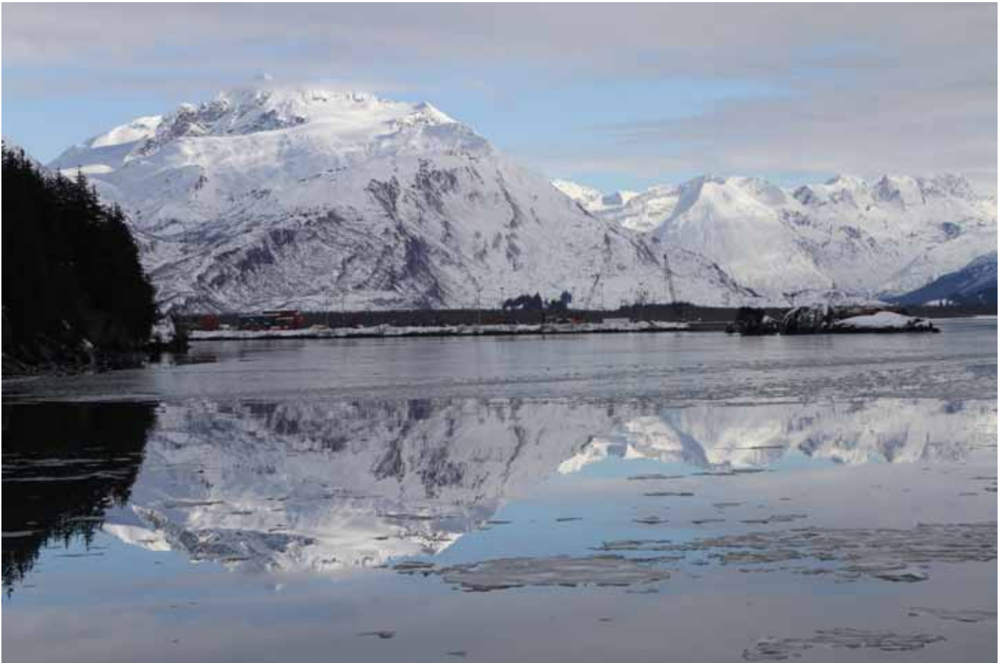
Mountains are reflected off Port Valdez in Valdez, Alaska, on Thursday, February 27, 2014.

Having made their crossing aboard anything that could float all the way from Seattle or San Francisco, the gold-seekers landed in Alaska. One hundred thousand of these stampeder, three quarters of whom were Americans, then made their way on to the gold fields in hope of finding riches. Little did they know about the challenges that 500 miles of Alaskan territory separating them from the gold fields of Dawson had in store for them. Many never com-