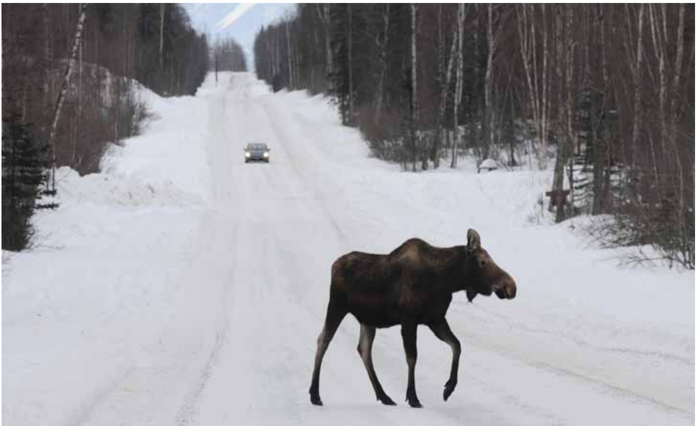
In this March 23, 2012 photo, a moose crosses a road near Anchorage, Alaska.

While moose are a big tourist attraction, tourists need to be aware that for their own safety as well as for the safety of the moose, they must not approach the animals too closely or feed the animals. A moose that becomes too familiar with humans and relies on them too much for food may be proclaimed dangerous and killed.