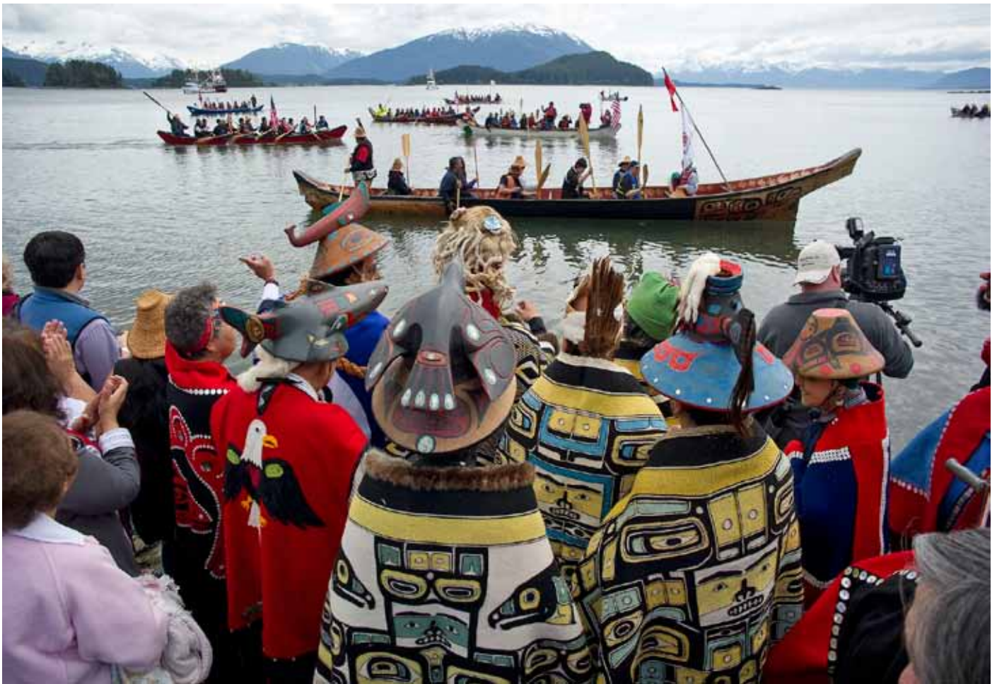
Members of the Auke Bay clan and hundreds of others greet seven canoes arriving at the Auke Recreation Area beach in Juneau, Alaska, in a Coming Ashore ceremony on Wednesday, June 6, 2012.

(From the Office of Historian: https://history.state.gov/milestones/1866-1898/alaska-purchase - U.S. Department of State)