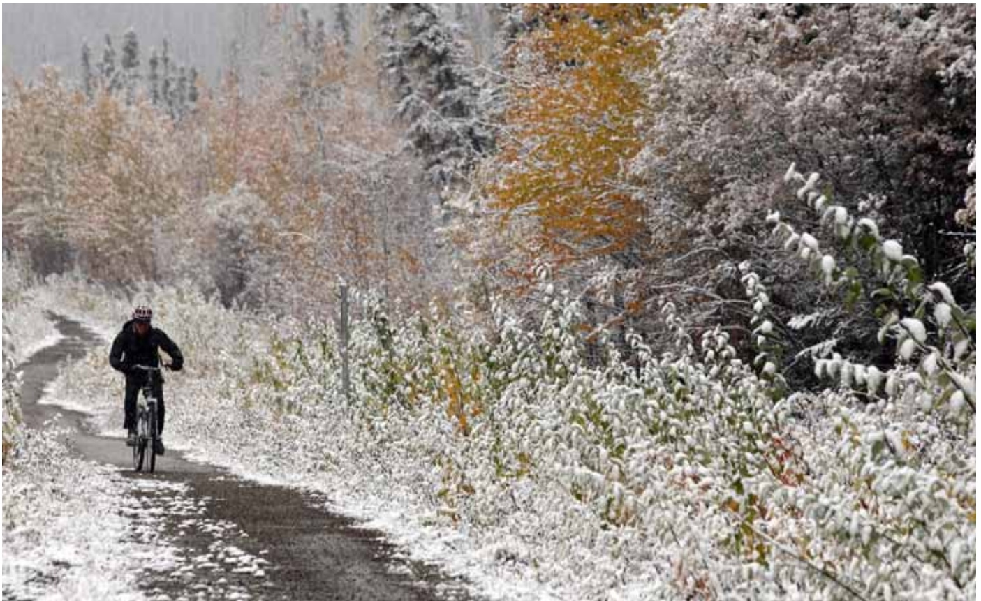
A bicyclist rides along the Sheep Creek Road bike trail as the first snow of the season continues to fall around Fairbanks, Alaska, on Wednesday morning, September 18, 2013.

On March 27, 1964, North America’s strongest recorded earthquake, with a magnitude of 9.2, rocked central Alaska. Each year Alaska has approximately 5,000 earthquakes, including 1,000 that measure above 3.5 on the Richter scale. Of the ten strongest earthquakes ever recorded in the world, three have occurred in Alaska.