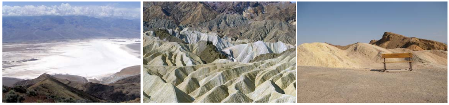
View from Dante's Point